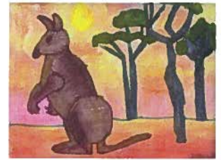
Samantha, Age 6

Examples: Kangaroos, Koalas, Crocodiles, Wild Dingos, Aboriginal Arts & Masks, Great Barrier Reef, etc. Let's go on a walkabout through the wild Australian Outback as we create vibrant artwork inspired by the native creatures and landscape! We'll learn fascinating facts along with Monart drawing techniques! A fact sheet will accompany the artwork home each week.